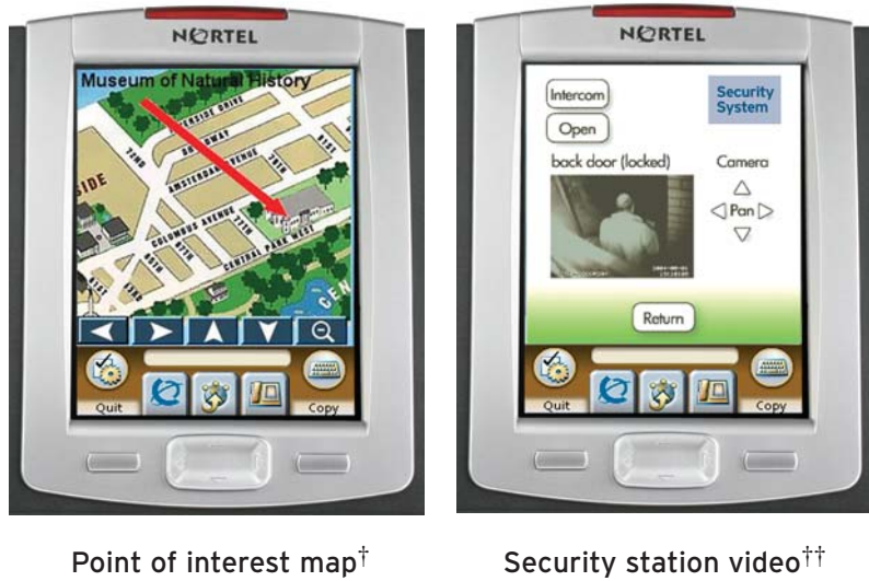
Point of interest map†