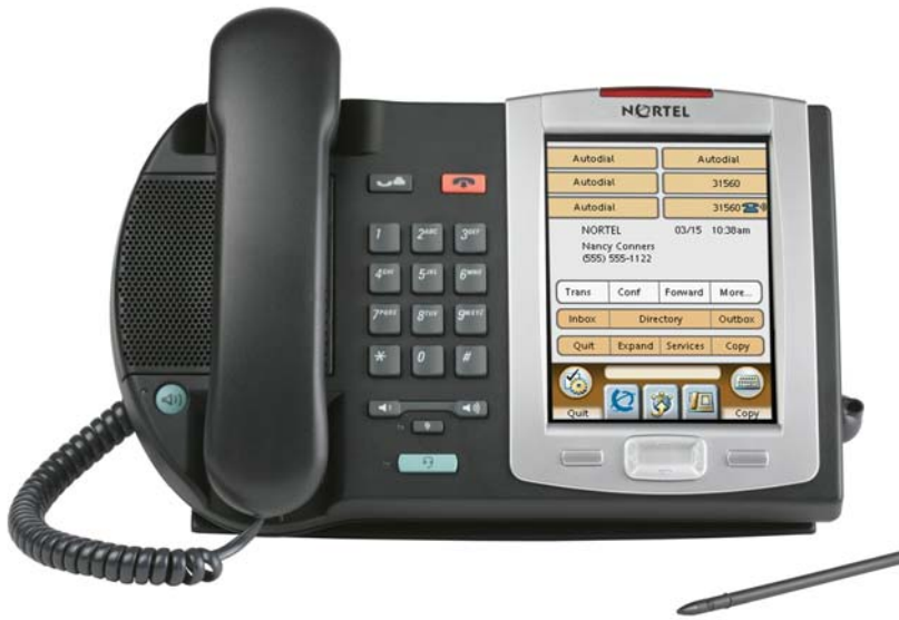
Figure 3. Nortel IP Phone 2007